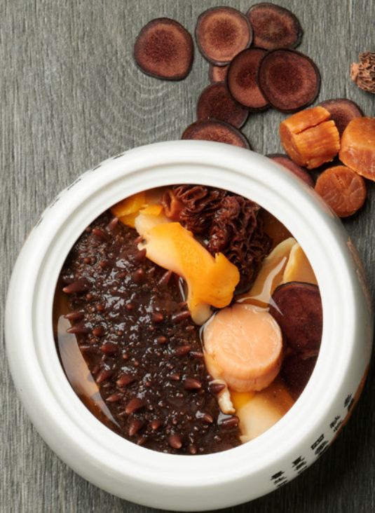
鹿茸刺参羊肚菌炖响螺 Double-boiled Deer Velvet Antler Soup with Sea Cucumber, Sea Whelk and Morel MOP 388

请告知您的服务员关于任何食物过敏或餐饮限制。所有价格为澳门币并需加10%服务费。图片只供参考之用。 Please inform our service staff if you have any food allergies or dietary requirements. All prices are in MOP and subject to a 10% service charge. Photos are for reference only.