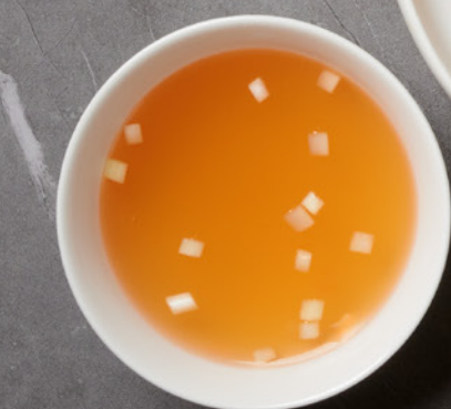
客家黄酒生蚝鸡汤米线 Poached Rice Noodles with Oyster and Yellow Wine in Chicken Broth MOP 148