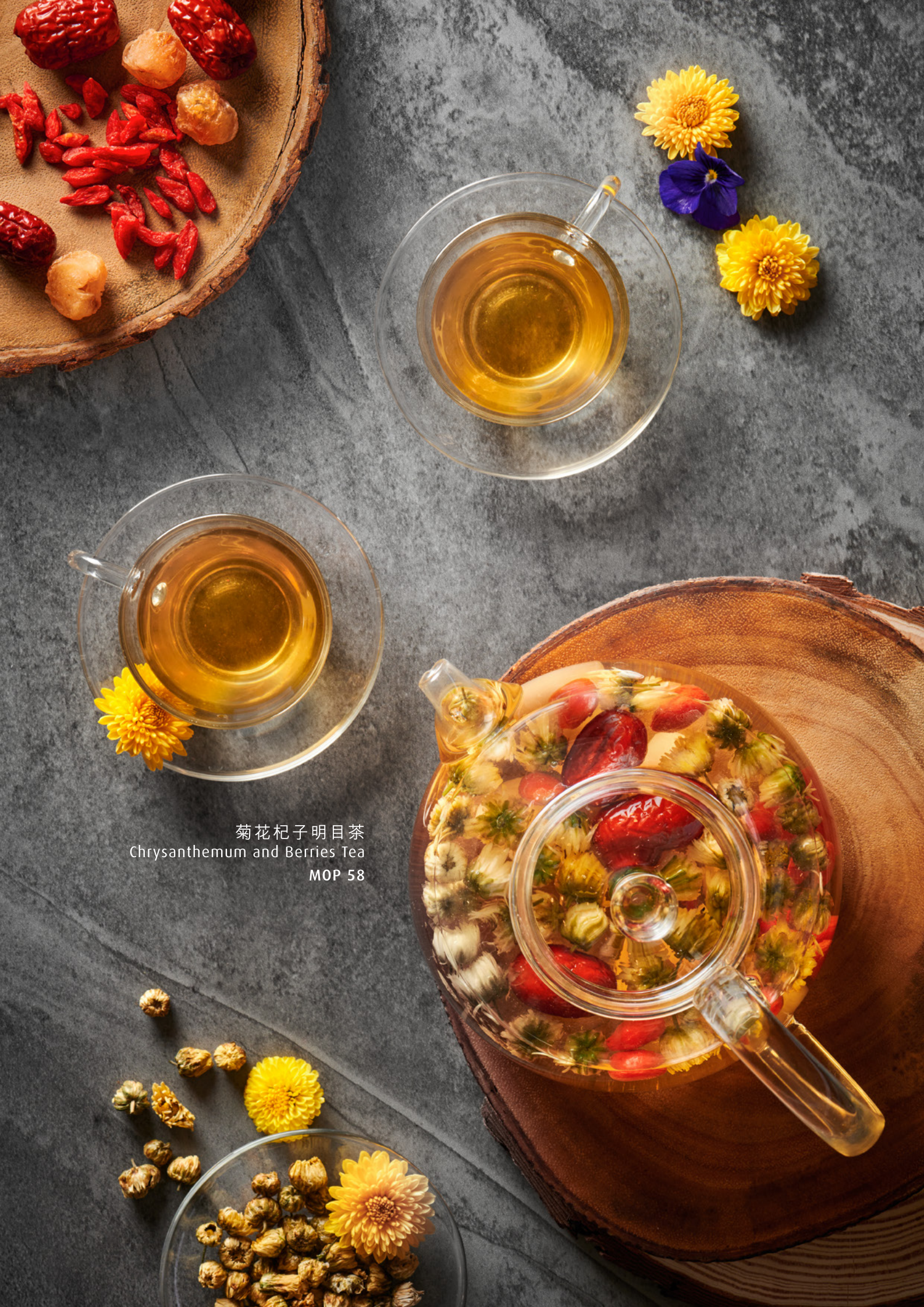
菊花杞子明目茶 Chrysanthemum and Berries Tea MOP 58

野生花旗参灵芝茶（益气养阴 调肝健脾） Wild American Ginseng and Lingzhi Tea 58