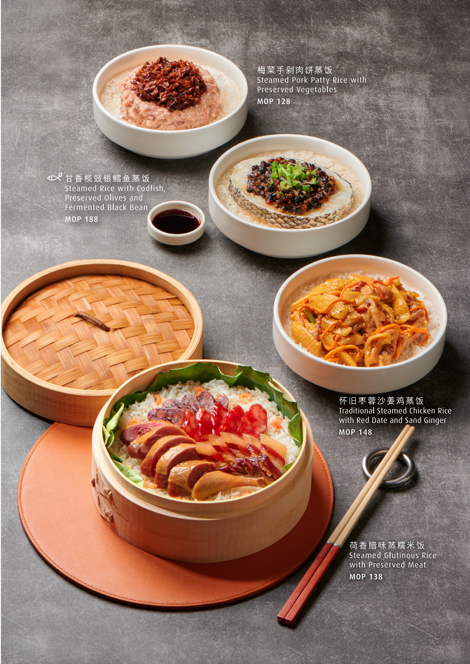
梅菜手剁肉饼蒸饭 Steamed Pork Patty Rice with Preserved Vegetables MOP 128

请告知您的服务员关于任何食物过敏或餐饮限制。所有价格为澳门币并需加10%服务费。图片只供参考之用。 Please inform our service staff if you have any food allergies or dietary requirements. All prices are in MOP and subject to a 10% service charge. Photos are for reference only.