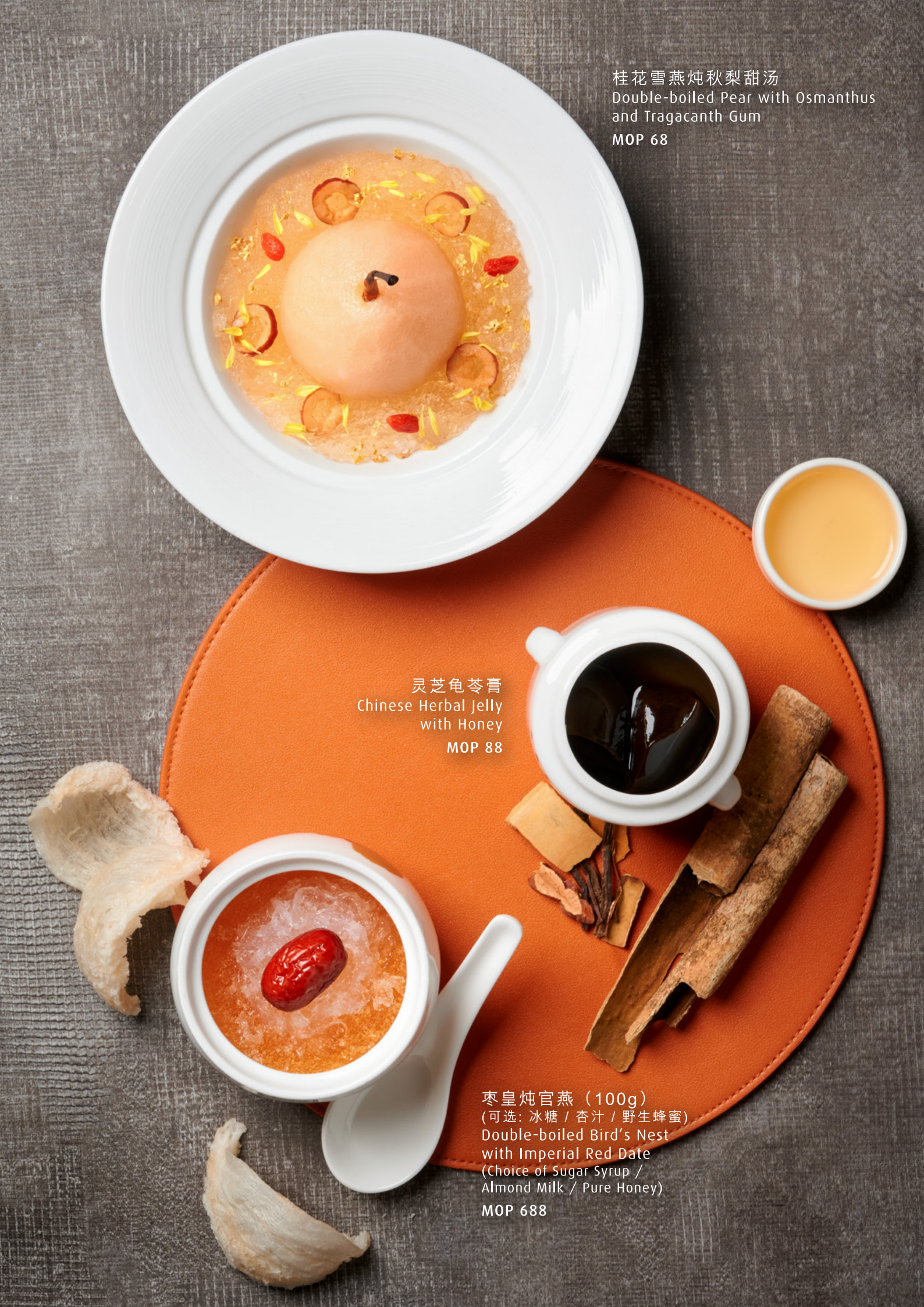
桂花雪燕炖秋梨甜汤 Double-boiled Pear with Osmanthus and Tragacanth Gum MOP 68

请告知您的服务员关于任何食物过敏或餐饮限制。所有价格为澳门币并需加10%服务费。图片只供参考之用。 Please inform our service staff if you have any food allergies or dietary requirements. All prices are in MOP and subject to a 10% service charge. Photos are for reference only.