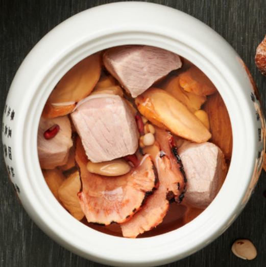
牛大力土茯苓炖猪腱 Double-boiled Pork Shank with Smilax Glabra and Chinese Herbs MOP 128